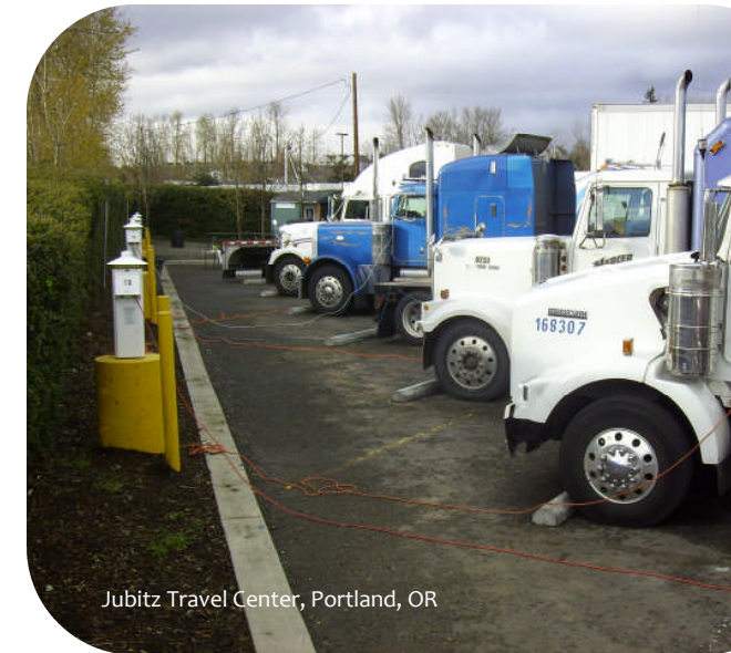
Jubitz Travel Center, Portland, OR

Power, Cable TV and Wireless Internet Services