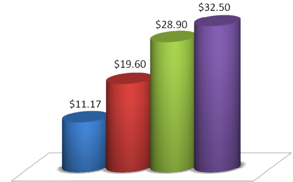
Total Average Daily Cost (10 hour req'd rest period)

* Includes initial equipment investment (where applicable)